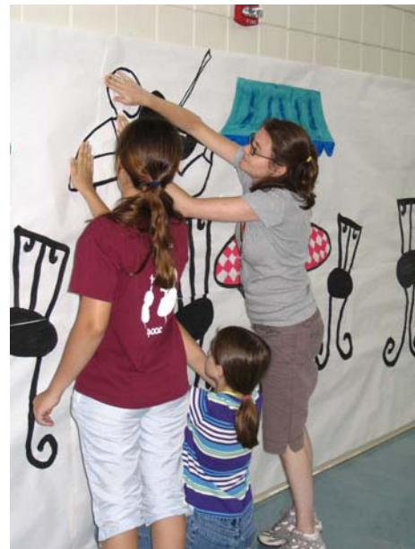
Participants of Richmond ACTS help decorate for the Ball

Also, thank you to everyone who responded to the August mailing and signed up to assist with outings!!