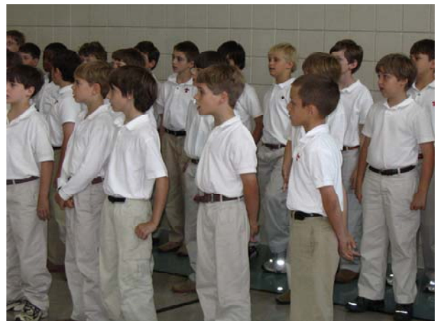
St. Christophers' choir entertains residents in the gym

The events in the lives of our residents—including diagnosis, medical and social condition—are confidential and fall under HIPAA regulations. HIPAA imposes both civil and criminal penalties for violation of these rules. For example, individuals who divulge information maliciously or for a profit can be fined up to $200,000 or imprisoned for up to 10 years.